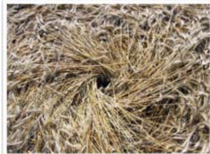
Not easy to reproduce with a board!

Give love to those who disrespect you. It doesn't remove anything from you. To puff your chest up will not make you more respected. The more you show refinement, the more you are respected. The more love you give to those who hate you, the less weapons they have against you.