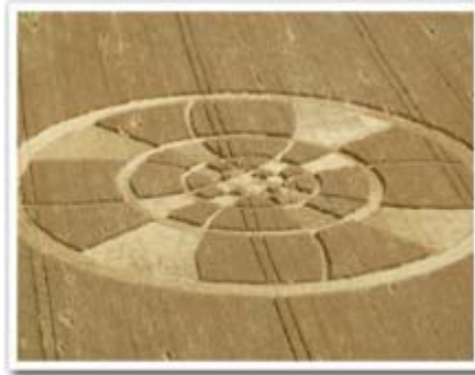
Dommartin, July 61 aH