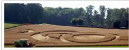
Neuchatel, Aug 6th 62 aH