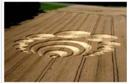
Vaud County, July 61 aH