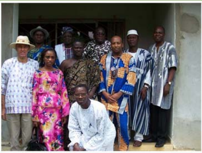
Superior Council with His Majesty Nanan TEHOUA II , King of ARRAH